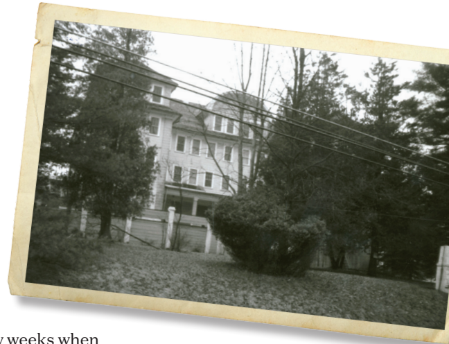
Harav Moshe Feinstein, learning under the tree, would run up the stairs to answer phone calls with shailos .